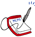
Figure 3B6-1 Assessment Activity Map

All points are located in the lower right-hand corner. To clearly identify the designated points and terrain features, Figure 3B6-1 is best viewed in colour.